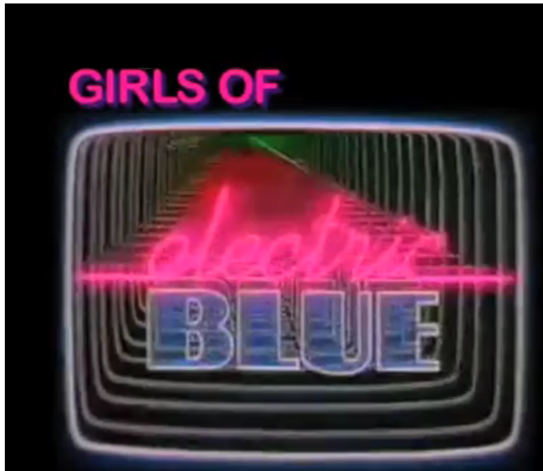
Figure 1: Promotional cover art for Electric Blue .

American adult-film star Marilyn Chambers. This compilation incorporated sketches, musical numbers, lesbian fantasy sequences, a nude disco competition, and archival footage of well-known figures, including Marilyn Monroe, Joanna Lumley, Jacqueline Bisset, and Jayne Mansfield's bath scene from Promises! Promises! (1963). Released theatrically in the United Kingdom in 1982 with an X certificate, and subsequently on VHS in 1983, the film further cemented the brand's visibility.